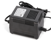
AC24V/3A Power Adapter